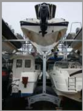
SOLUTION 2 FLOORS 9 linear meters - 5 BOATS