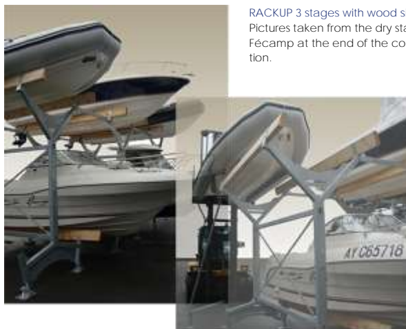
RACKUP 3 stages with wood siding Pictures taken from the dry stack of Fécamp at the end of the construction.